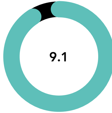
Content Strategy & Creation